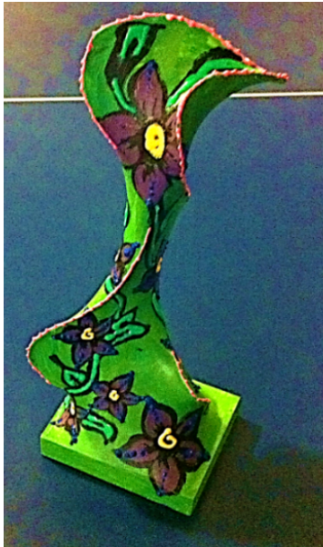
Wire & mesh abstract