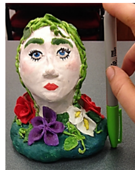
Sculpey polymer clay bust over wire armature