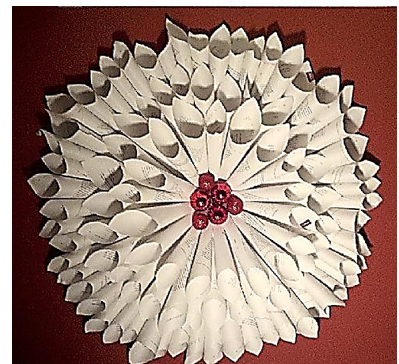
rolled book page Xmas wreath