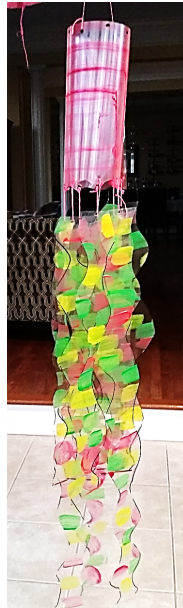
Dura-lar transparent Hanging mobiles