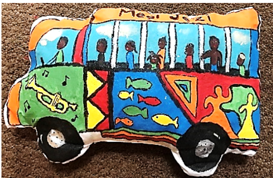
Fiberfil stuffed soft sculptures