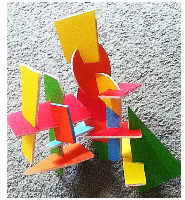
Foam core slotted abstract