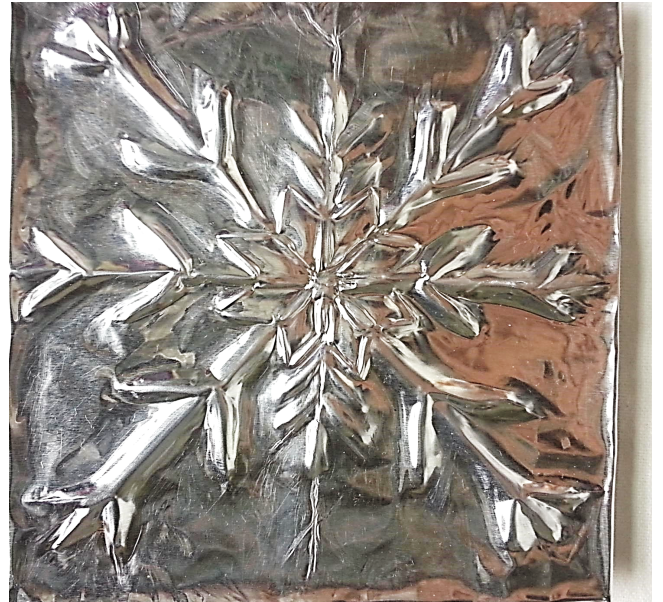
Tooled (embossed) metal