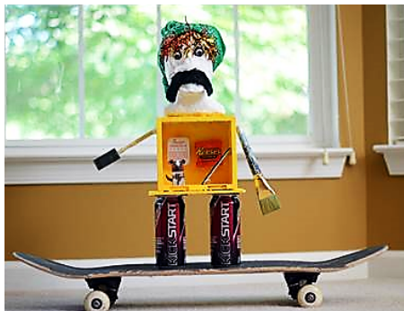
Assemblage self portrait